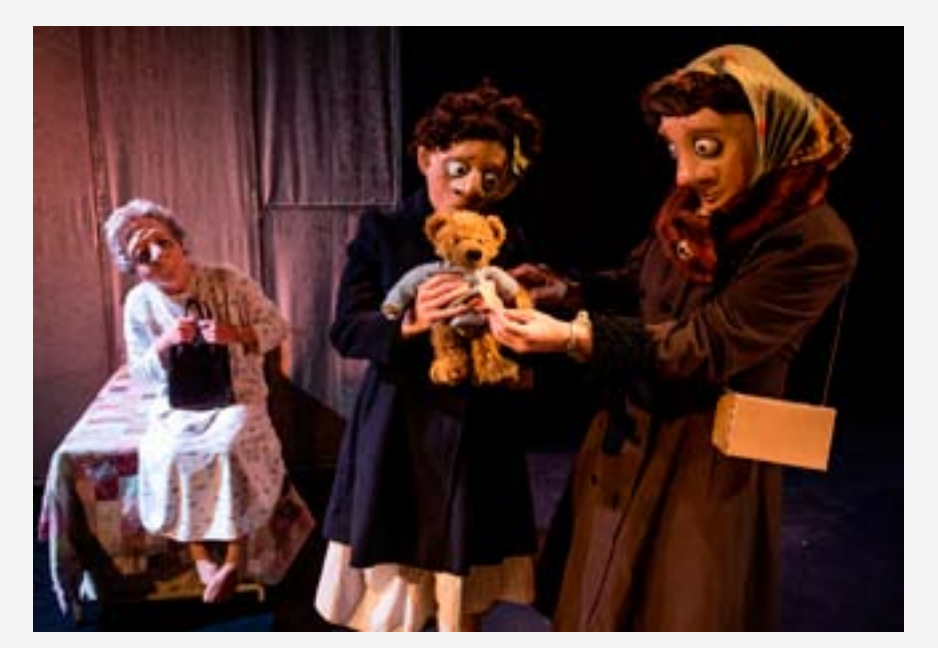
Scene 7: The train station Joy as a child is at the train station during the war, waving goodbye to her mum. Both Joy and her mum are very sad to leave each other.